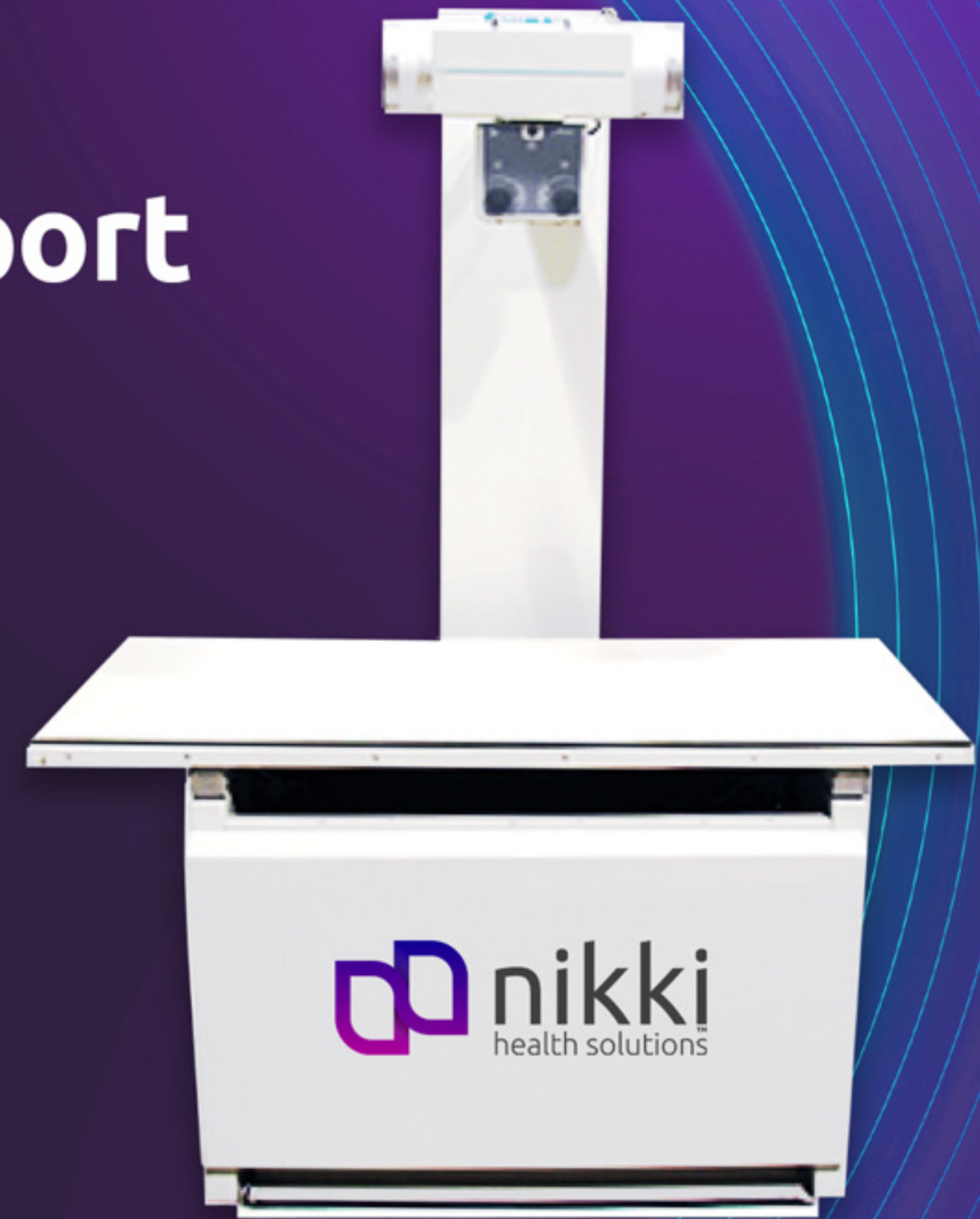
Raynext™ X-Ray System